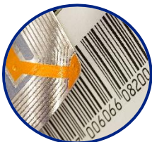
RFID & BARCODE

Call Vertical Systems to consult with our automation experts today!