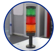
STACK LIGHTS & GPO